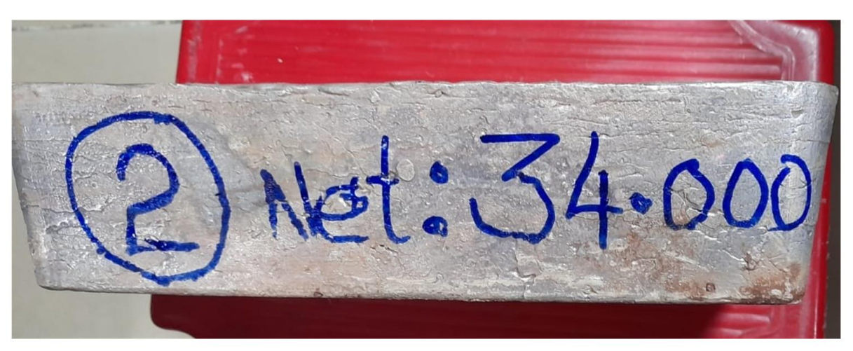
Package No. 2 – 34 kilos of 1 (one) Silver Ingot (99.9% finesse)