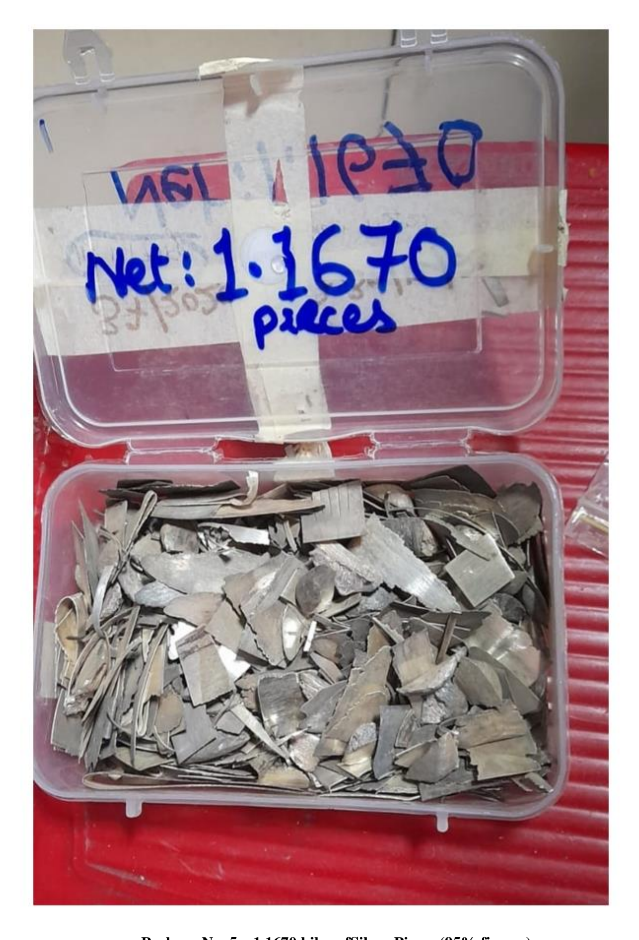
Package No. 5 – 1.1670 kilos of Silver Pieces (95% finesse)