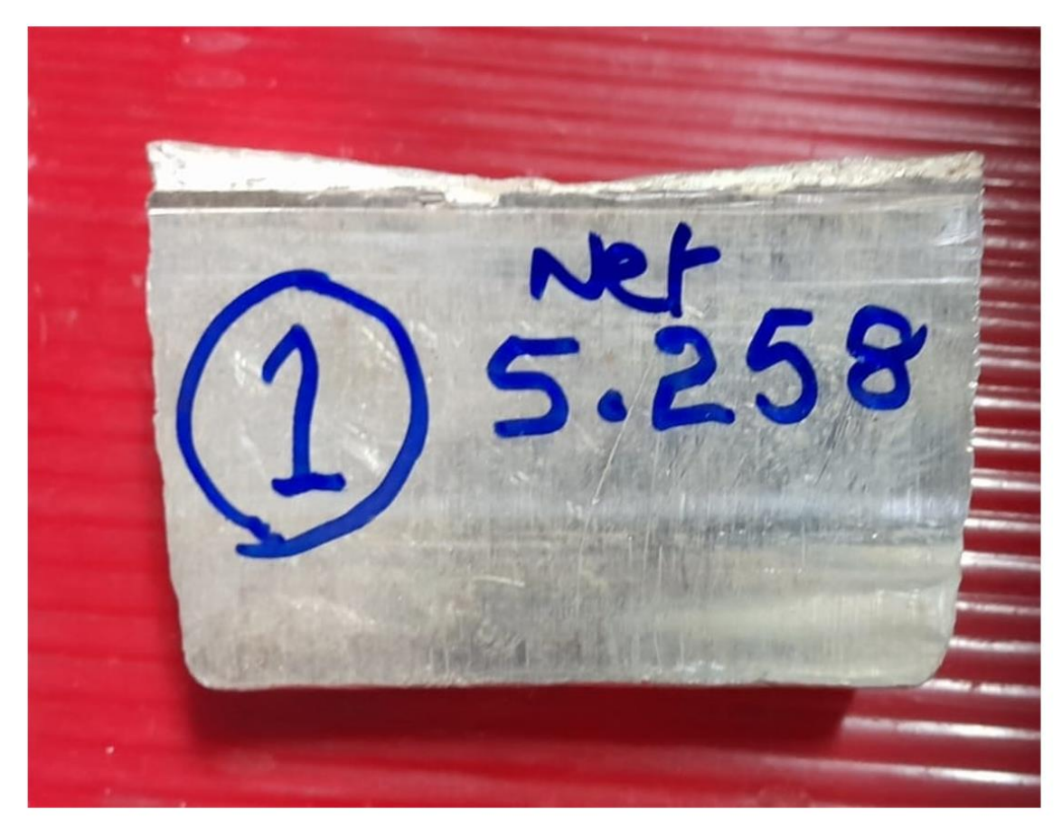
Package No. 1 – 5.258 kilos of 1 (one) Silver Block (99.9% finesse)